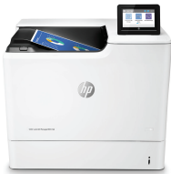
HP Color LaserJet Managed E65150dn

Dynamic security enabled printer. Only intended to be used with cartridges using an HP original chip. Cartridges using a non-HP chip may not work, and those that work today may not work in the future. http://www.hp.com/go/learnaboutsupplies