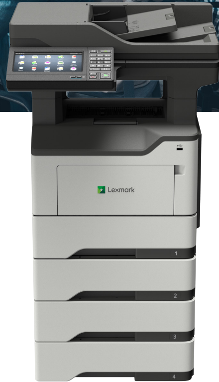
XM3250 with optional trays