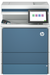
HP Color LaserJet Enterprise MFP X57945dn Printer

This printer is intended to work only with cartridges that have a new or reused HP chip, and it uses dynamic security measures to block cartridges using a non-HP chip. Periodic firmware updates will maintain the effectiveness of these measures and block cartridges that previously worked. A reused HP chip enables the use of reused, remanufactured, and refilled cartridges. More at: http://www.hp.com/learn/ds