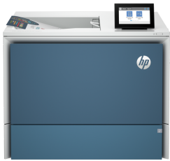
HP Color LaserJet Enterprise X55745dn Printer

Transform your workflows with advanced capabilities in a compact footprint. From print speeds to color panels, get flexible configurations to meet your needs today and tomorrow. All while protecting your business against evolving cyber threats.